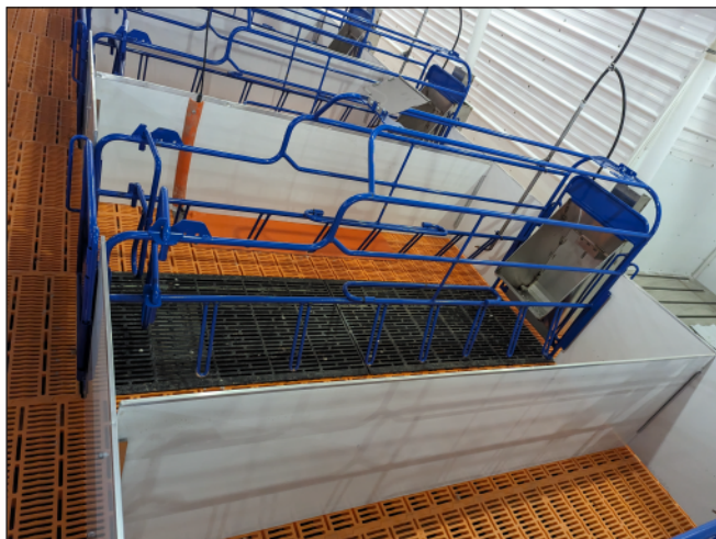
DuraPanel dividers can be used with Farmweld's A-Crate.

The A-Crate has low back sides - just 25" (635 mm) from the floor - giving the farrowing room crew easy access to the sow and piglets without having to open or climb over gates. Finger-bar or bow-bar options are available.