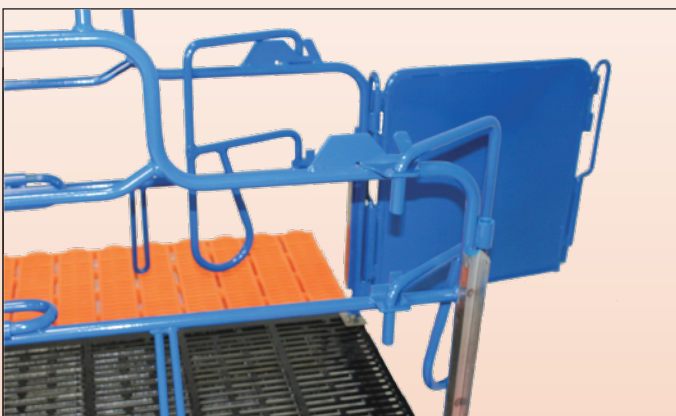
Front and back gates both have quick-release , making it simple to manipulate with just one hand. Non-removable pins mean they won't get dropped or misplaced.

Swinging Rump Guard gates open forward and backward , giving workers excellent access to assist during farrowing even when the sow is lying up against the gate. It also makes it easy to clean up behind the sow.