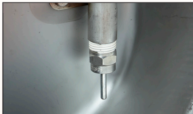
Cups feature the Edstrom™ nipple (No screen or spring inside).

Enclosed nipple means fewer injuries and less trim loss compared to standard nipple brackets.