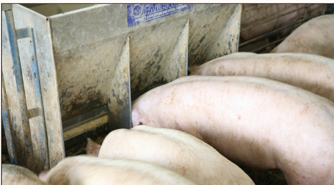
Farmweld Jumbo Feeders - Ideal for wean-to-finish - promote a quick start for early-weaned pigs and less sort loss at finishing.